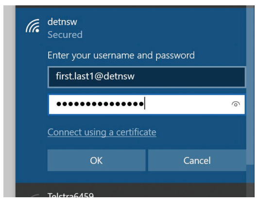
Step 4: If prompted, press connect