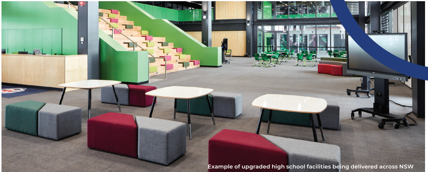
Example of upgraded high school facilities being delivered across NSW