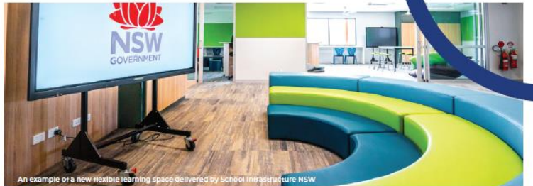
An example of a new flexible learning space delivered by School Infrastructure NSW