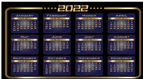
SENTRAL PARENT CALENDAR