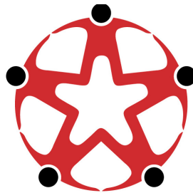
CHC NEWSLETTER ISSUE 149