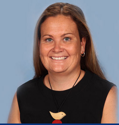
CAMPUS LEADER REPORT