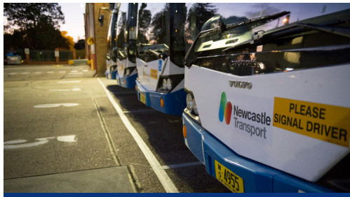
STUDENT TRAVEL UPDATE