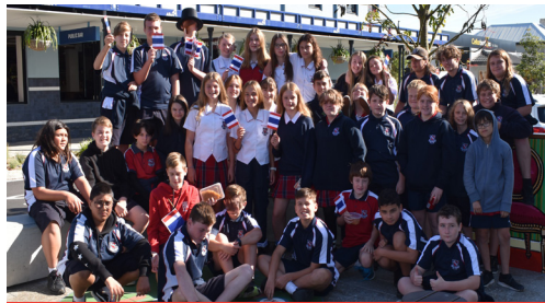
FACULTY FOCUS - ENGLISH

headspace Newcastle presents an informative webinar on