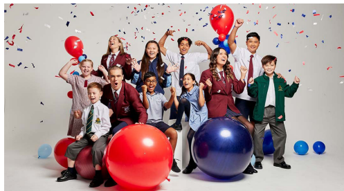
COUNTDOWN TO ED. WEEK