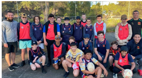
CLONTARF - POST