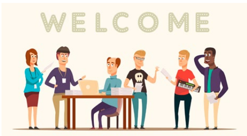
TO ALL OUR NEW STAFF