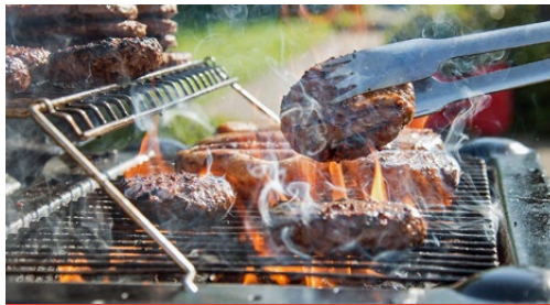
MEET THE TEACHER BBQ