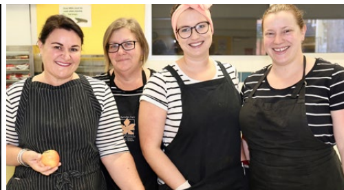
CANTEEN MENU TERM 1