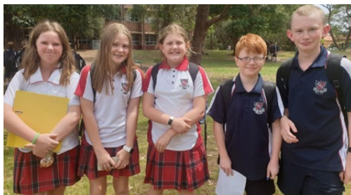
Y7 Y9 Y11 REPORT