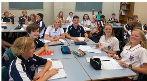
Y8 Y10 12 REPORT