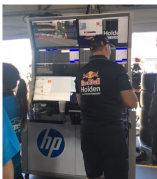
engineering in the pits