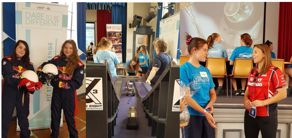
Red Bull racing suits