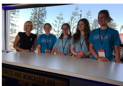
2 Converted rev heads!