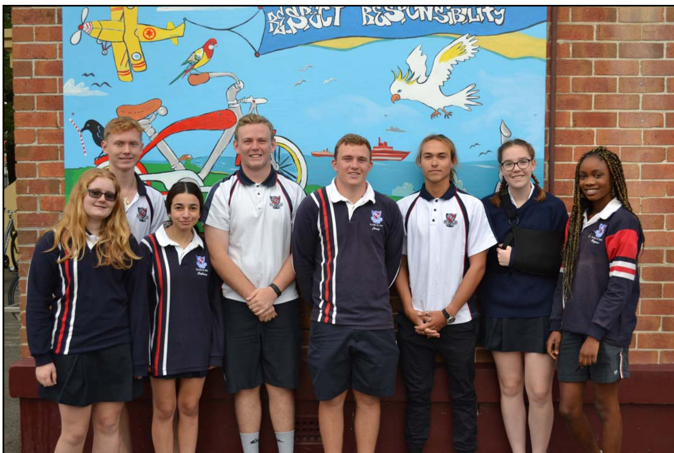
2016 School Student Leaders