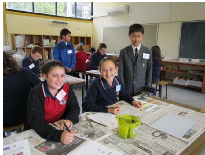
Calligraphy practice at the Sydney Japanese International School