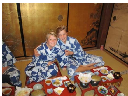
Japan trip 2014 Photos

NB: Students and parents should be aware that students are invited to participate on all our overseas trips after they have completed an application. Students must demonstrate their record of respect, responsibility and participation at school and show themselves worthy of representing Newcastle High School.