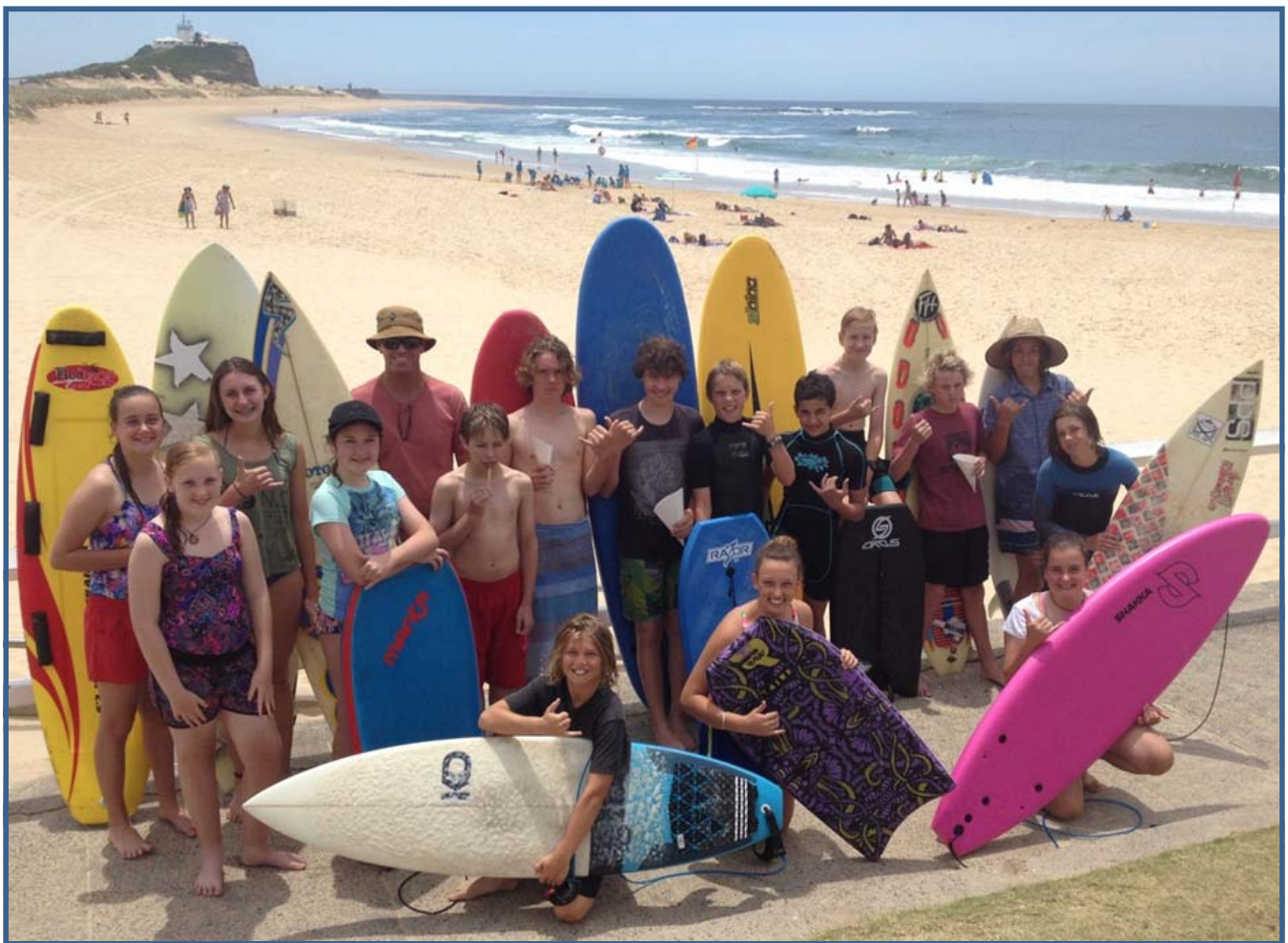
Students enjoying themselves during the Surf Survival Course