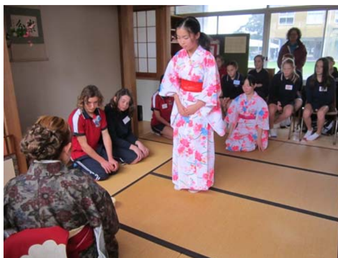
Tea Ceremony at SJIS