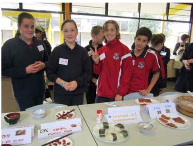
Making onigiri at SJIS

Students study the Japanese writing script of Hiragana and learn to recognise the Katakana and Kanji scripts as well. They also study from the textbook ' Hai! ' and its companion workbook, doing simple reading, writing and listening exercises in Japanese. Students are asked to pay $17.00 at the student office to purchase a Hai! Workbook . A yearly calendar of Japanese festivals is followed and students also explore and learn about various aspects of Japanese culture: origami, songs, anime, martial arts, religion etc. An excursion in June to the Sydney Japanese School is a