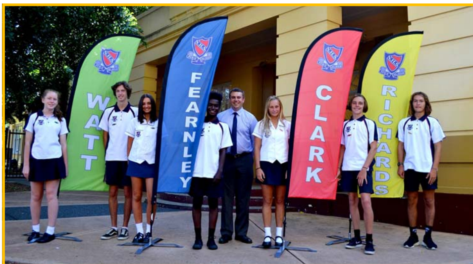
Congratulations to our 2016 House Captains: