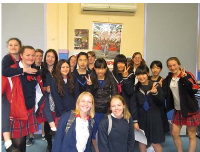
Ube exchange 2015