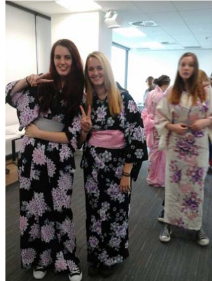
Japan Foundation, Sydney - cultural workshop on the Obon Festival