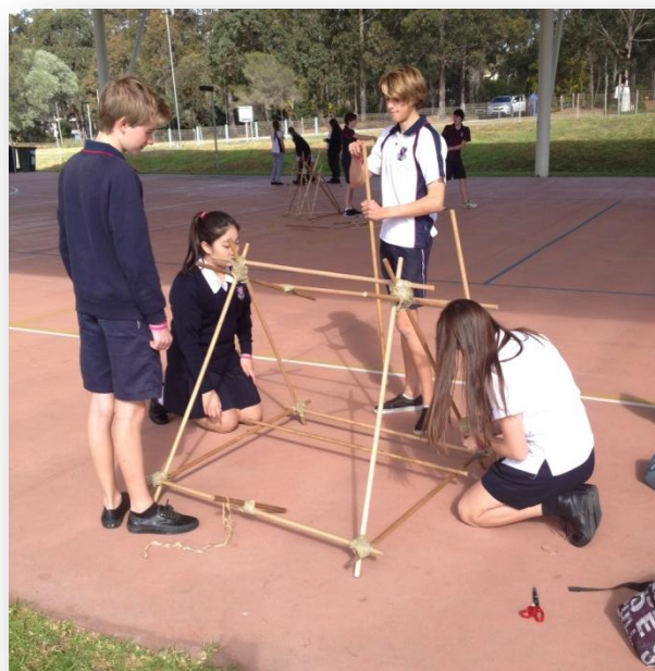
Year 10 students at Science and Engineering Challenge