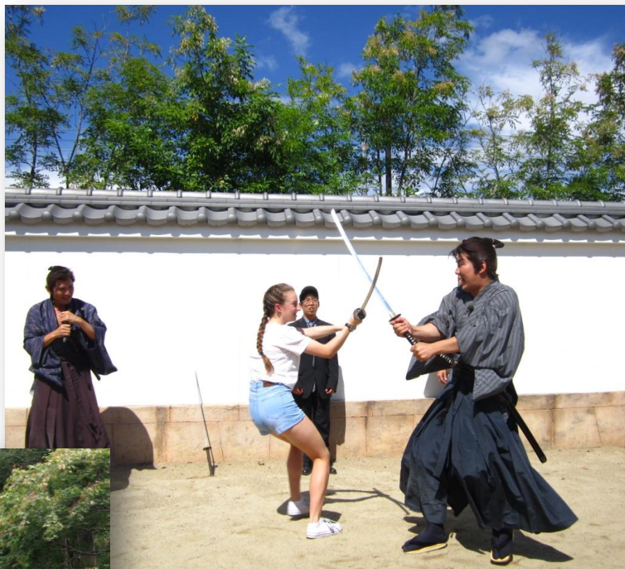
Images from the 2014 Japan Excursion