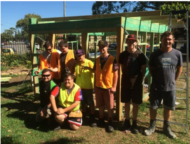
Horticulture BBQ provided by Bunnings in front of the learning centre.