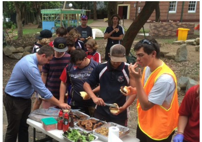
Horticulturalists in front of the new partially built greenhouse