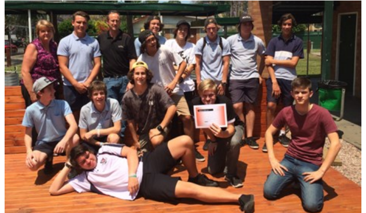
Graduating students in the Links to Learning project in Hairdressing and Construction.