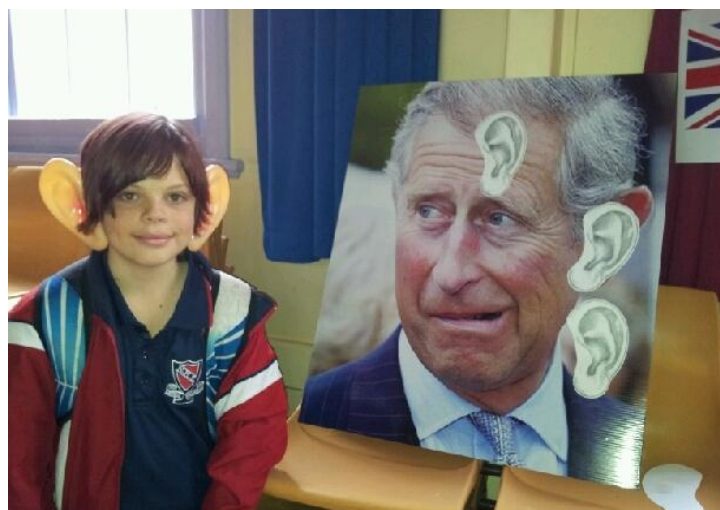
Pin the Ears on Prince Charles