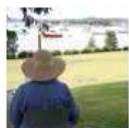
Peter Sharp Friday 10 January Abstract drawing and painting