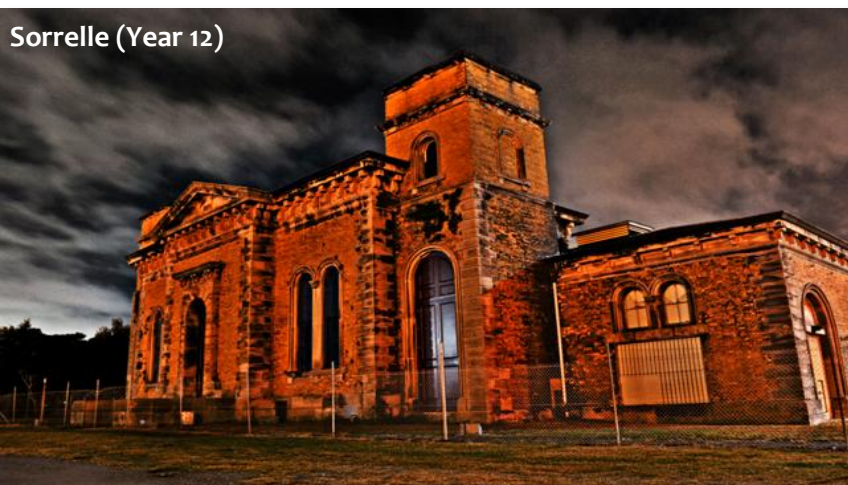
Sorrelle (Year 12)