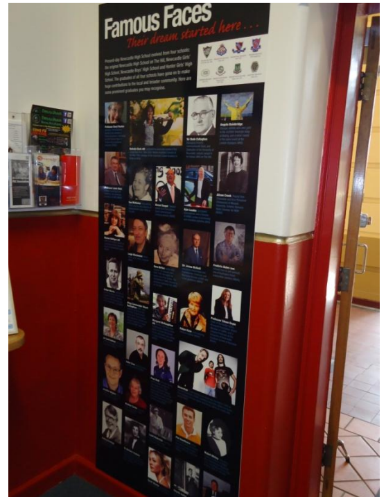
Some Famous Faces of former students from the Newcastle High Schools

Fun, fast and exciting is how the kids are describing the local T20 cricket competition! Grab some mates and come and join the exciting new 20/20 competition.